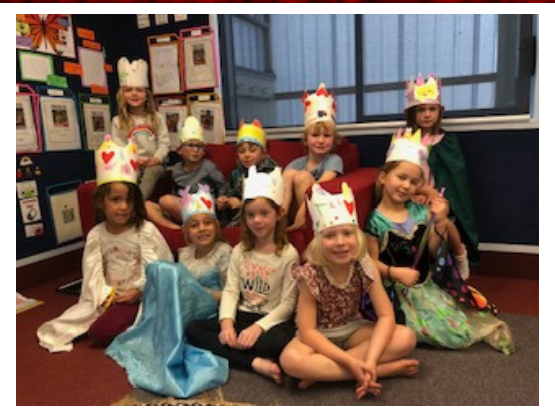
Rata class made crowns to celebrate the King's Coronation

Doors open 5:30pm, dinner served from 6pm, quiz starts at 7pm, auction at 8:30pm Info & tickets www.temiro.school.nz/pta