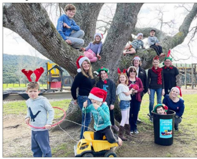
The Te Miro School community is helping boost the Cambridge Christmas Cheer initiative.

The Te Miro School community raised around $400 for the Cambridge Christmas Cheer programme last month.