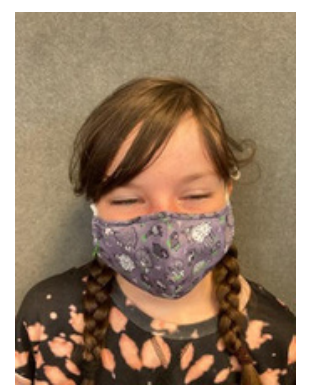
Bodhi - Billy Goats (Blue)