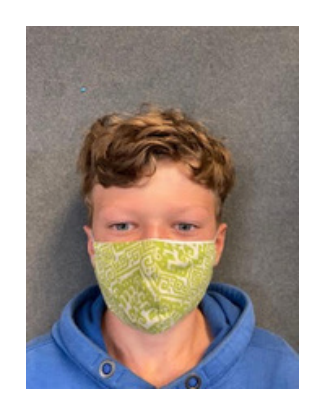
Calum - Dinosaurs (Black)