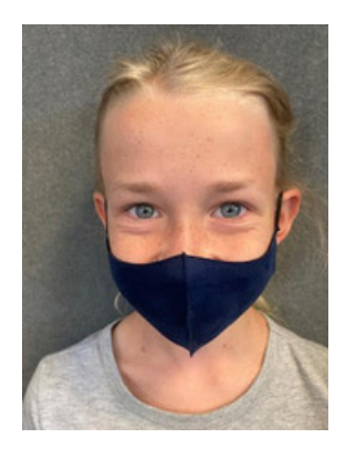
Ariana - Brainy Avocados (Green)