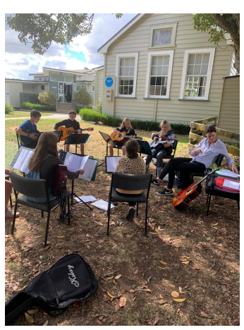
Guitar lessons under the tree

Monday 21st March Wednesday 30th March Thursday 7th April