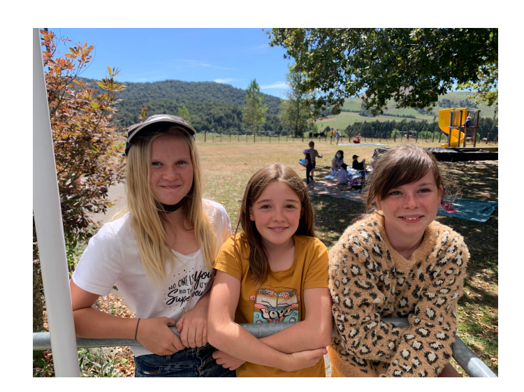
Enviro School Leaders 2022

Thank you for reading this-Enviro School Leaders.