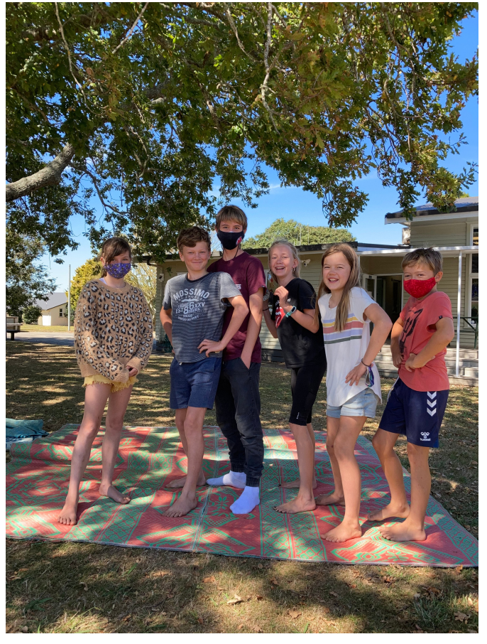
School Reps 2022