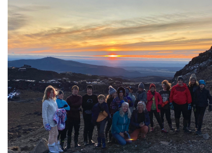
Seniors ski camp