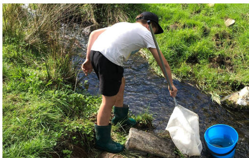
Seniors stream testing with Enviroschools