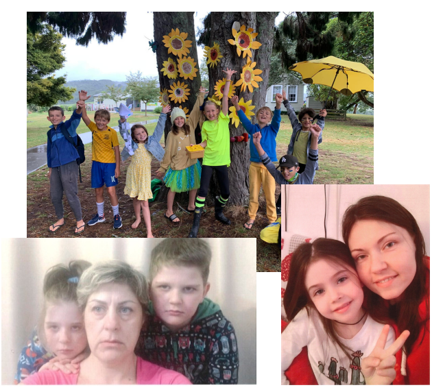
Dress up day and the two Ukrainian families who received the funds

Senior students are settling into their leadership roles. So far this year the school representatives have organised a dress up day to raise funds for Ukraine and have helped organise our Summer Festival and the Autumn Harvest Festival. The Enviro team have put in place Nood Food Fridays which encourages children to bring no plastic wrapped food.